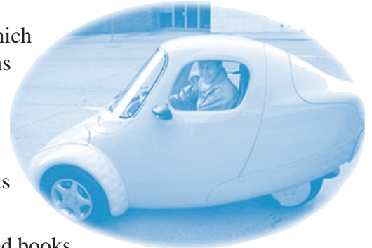
The Green Warrior

Also present: “Recycle, Reuse, Reduce” at the SME library fund-raiser. Used books, CDs, videos, and formal wear will be for sale.